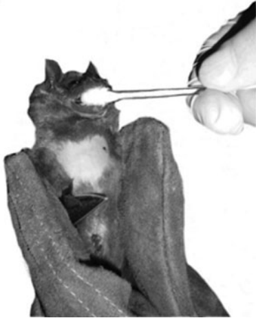
Figure 5. Oral samples collected using a swab.

media. If using chemical methods to preserve DNA or RNA for later collection, be sure researchers have been informed of the hazards and exposure potential of these chemicals, as well as how to clean up spills or decontaminate them. It may be particularly important to know whether bleach can be mixed with certain nucleic acid extraction buffers.