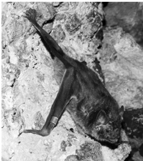
Figure 2. Hematophagous male Desmodus rotundus bat marked with an aluminum-magnesium ring on the forearm; this individual was followed for more than 4 years.

Long-term marking methods include plastic or metal rings fixed over the forearm. Bat bands, or aluminum-magnesium bird rings, between 3 and 5 mm, depending on the size of the bat, can be considered. The authors have observed that certain bird rings are durable, effective, and do not harm animals, as supported by longitudinal studies following hematophagous bats individually for up to 4 years using this method (Figure 2). However, multiple studies have demonstrated that the use of metal bands can result in injury and reduced fitness, and various societies have issued position statements recommending against their use for certain species. 67–70 Therefore, the use of metal bands should be carefully considered in conjunction with the IACUC.