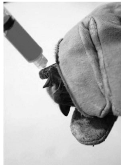
Figure 1. Administering fluids before blood draw is recommended. Hold a bat head-down when administering oral fluids to prevent liquid reaching the respiratory system.

The authors have observed that hematophagous bats accept Hartmann's or Ringer's solution for oral hydration, whereas large frugivorous species such as Artibeus jamaicensis or Artibeus lituratus accept commercial beverages generally used to help humans recover carbohydrates and electrolytes, and nectarivorous species gladly accept sugar water. Many formulas have been reported for the rehabilitation of lactating or juvenile