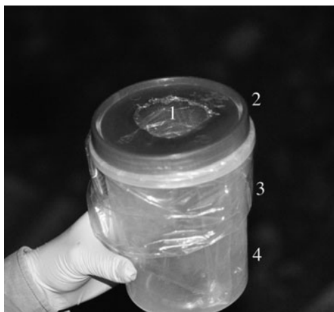
Figure 3. Handmade container for urine and feces collection. Soft mesh (1) and a lid with an air hole (2) restrain the bat within the plastic collection bag (3) that lines the hard-sided plastic container (4).

When puncturing a blood vessel with only a thin patagium around it, consider using puncture-resistant gloves, needle stick-proof gloves, or a metal thimble to protect the finger and hand being used to restrain and stabilize the blood vessel. Before beginning blood collection work involving sharps, position a sharps container within easy reach for direct disposal during the process. This